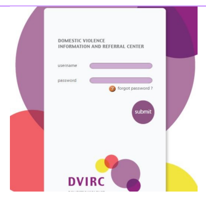
DVIRC Log-in Screen