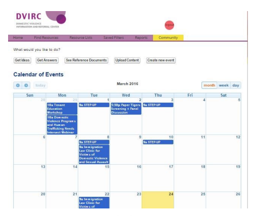
Connect With the Community